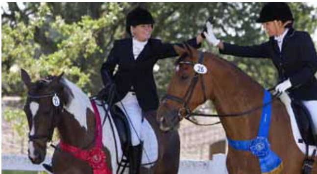
RAAC. Regional Adult Amateur Competitions for Amateurs to compete in Novice or Elite Divisions within their Region, North, Central and South.

Dressage (training or schooling) is an equitation term that means the gradual harmonious development of the horse's physical and mental condition with the aim to achieve the improvement of his natural gaits and perfect understanding with his rider.